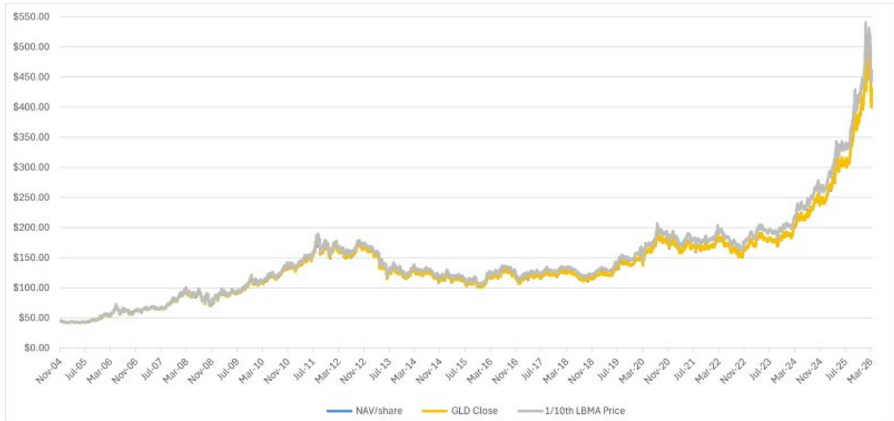
Share price & NAV v. gold price – November 18, 2004 to March 31, 2026

The divergence of the price of the Shares and NAV of the Shares from the gold price over time reflects the cumulative effect of the Trust expenses that arise if an investment had been held since inception.